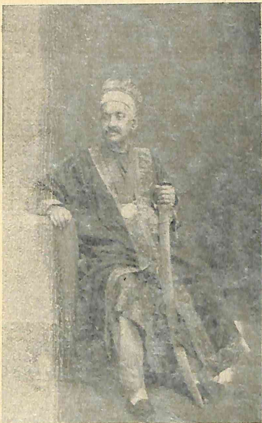
Nawab Amir Ali Khan Bahadur