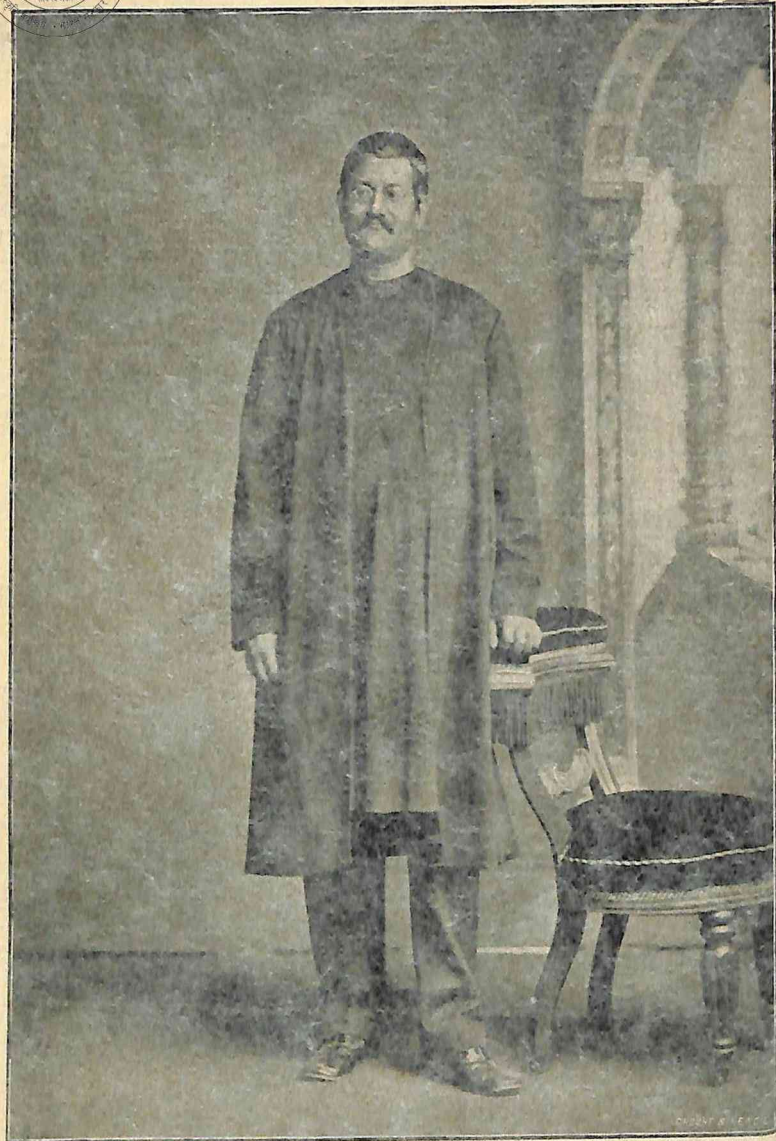
Keshub Chandra Sen