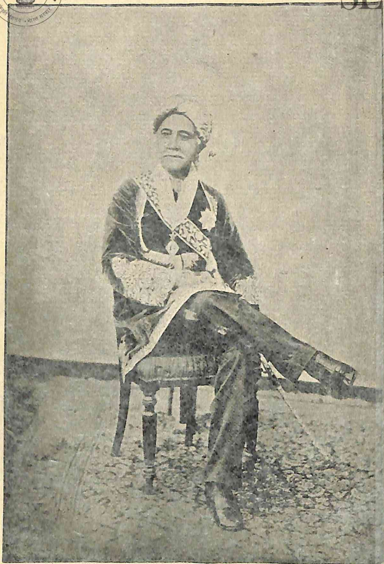
Nawab Sir Khawja Abdul Ghani Mia