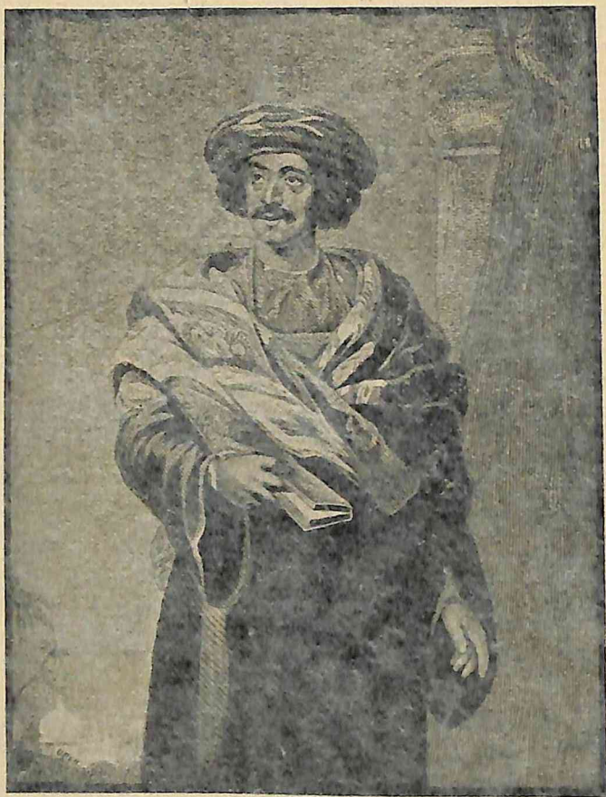
Ram Mohan Roy