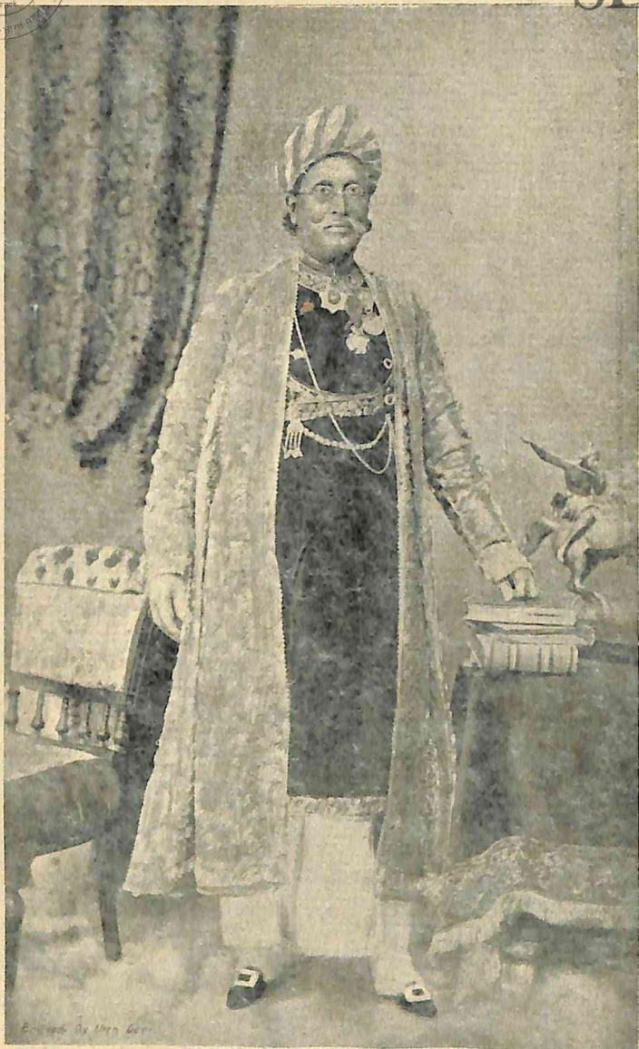
Nawab Abdul Latif Khan Bahadur