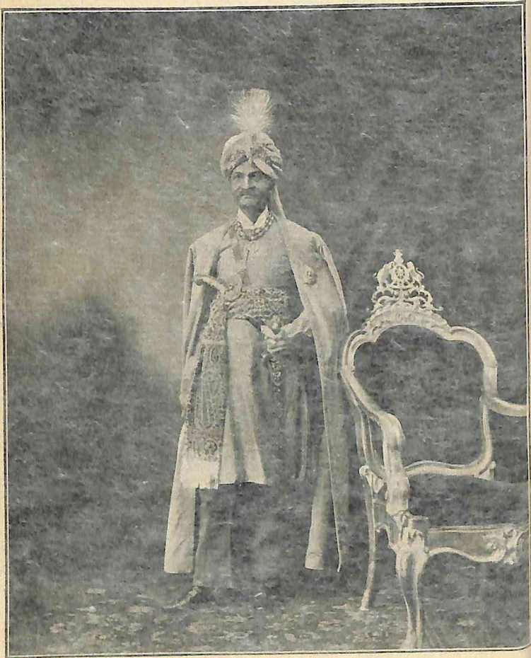
Maharaja Sir Jotindra Mohan Tagore