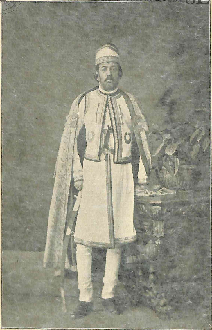
Maharajadhiraj Mahtab Chand Rai Bahadur of Burdwan